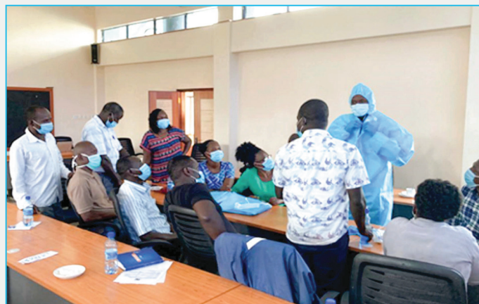
Infection Prevention and Control training (Donning and Doffing Sessions) Homabay County - January 2021.