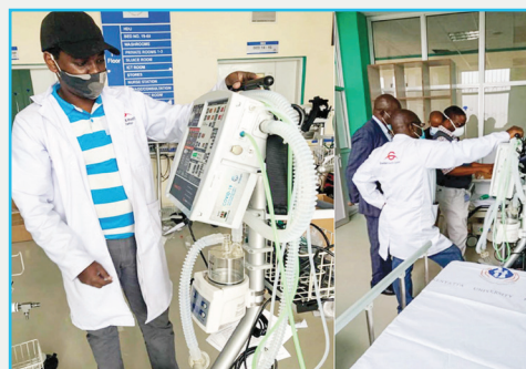
Health workers at Kenyatta University Teaching, Referral and Research Hospital (KUTRRH) being trained on the ventilators use.

“ The GoK has responded to the pandemic through health and non-health interventions such as expanding availability of testing, enhancing case management capacity, restrictions on movement to slow disease transmission and economic incentives to businesses and firms