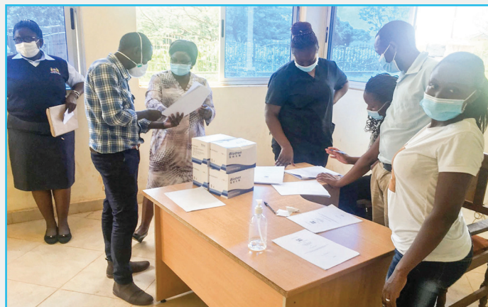
A visit to Busia one stop border point where a team of Health workers were deployed under the CHERP (5 Medical Laboratory Officers, 3 Public Health Officers and 2 Nurses).

The US$ 50 million CHERP, funded by the World Bank was approved in April 2020. Aligned to the World Bank strategic priority of ending extreme poverty and boosting shared prosperity, the project aims to prevent, detect, and respond to COVID-19 and strengthen national systems for public health emergency preparedness. In addition, the GoK has drawn on its own resource and the support of partners to implement a range of health and non-health interventions.