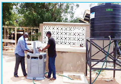
Garissa County Referral Hospital handwashing facility - 25 th September 2020.