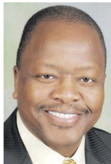
Hon. Mutahi Kagwe, EGH