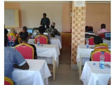
Sensitization session in Isiolo-Landmark Hotel