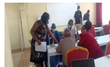
Nakuru Session-Filling consultation matrix